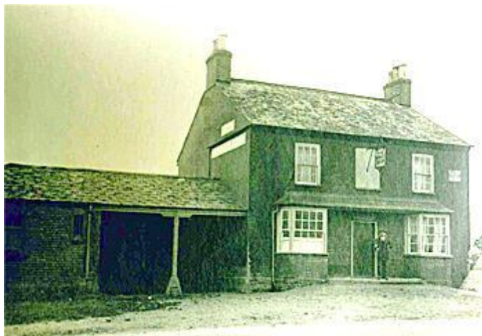
The Barley Mow (now The Airman Hotel) – about 1925